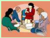
Commissioning Group –