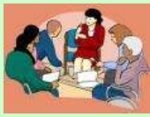
Commissioning Group –