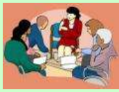
Commissioning Group –