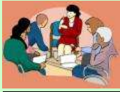
Commissioning Group –