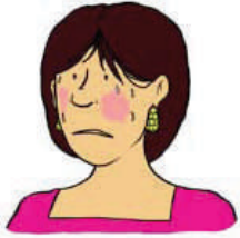
Feel very hot