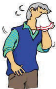
Cough and sneeze