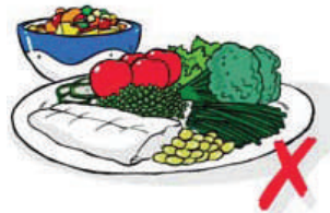
Not want to eat food