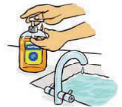
Wash your hands