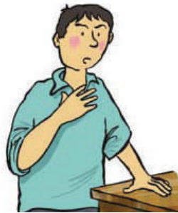
Short of breath