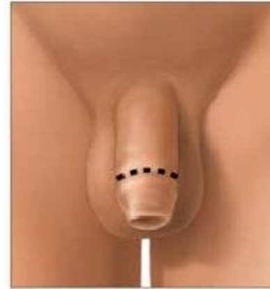
Foreskin is cut along dashed line